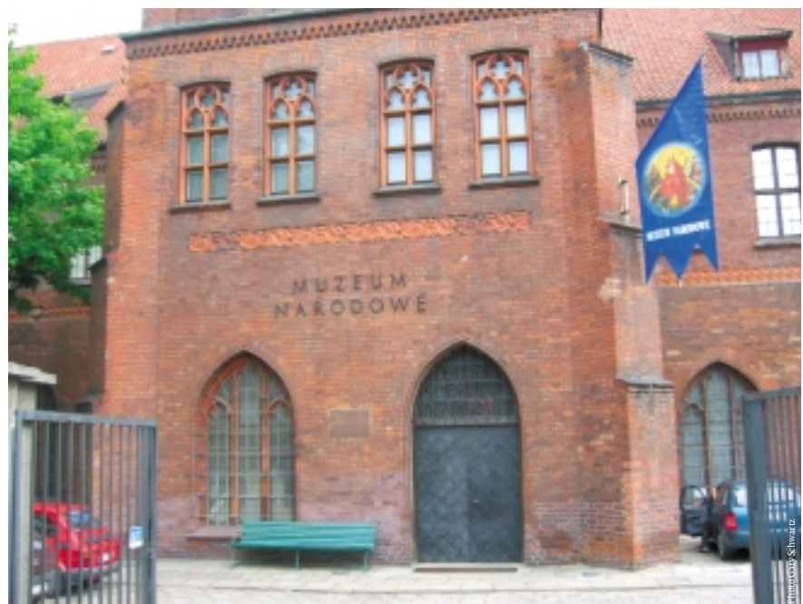
The National Museum in Gdańsk, with Memling's Last Judgment flying in the flag.

The early 20th-century building lies on the western edge of the old city, and was one of the few grand institutions of Gdańsk that was not destroyed in the war. The institution was founded in 1596 as the library of the city council, with a collection of 1,300 volumes belonging to the Italian humanist Giovanni Bernardino Bonifacio, marquess of Oria (1517–1597). It now contains over 300,000 items, including about 800 incunabula and more than 55,000 old prints. (From the booklet The Gdańsk Library of the Polish Academy of Sciences by Maria Babnis, published by the library in 1999.)