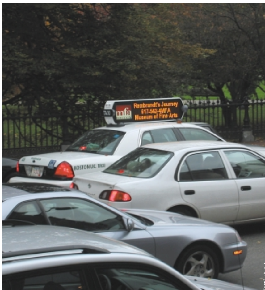
A Boston taxi during the CODART ZES study trip.