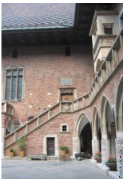
Inner court of the Collegium Maius, Kraków, a 15th-century university building, now the home of the Museum of the Jagiellonian University.

'The courtyard is the best example of Italian Renaissance architecture in the castle. The arcades, borrowed from 15th-century Florentine design, are perfect semi-circles