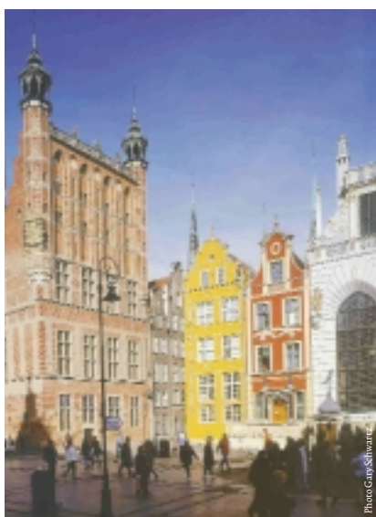
Former town hall of Gdańsk, now the Historical Museum, and the Court of King Arthur.

– a choice of manuscripts, documents, atlases and books linking Gdańsk to the Netherlands.