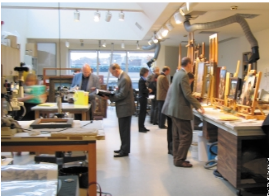
In the conservation lab of the Worcester Art Museum.