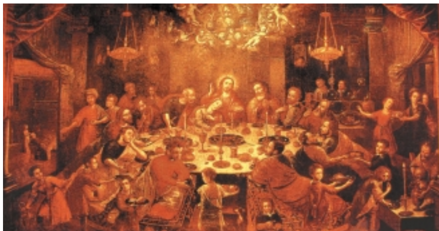
Diego de la Puente (attributed to), The Last Supper , Convento de San Francisco, Lima.

Around the turn of the 18th century, a new iconographic theme became popular in some colonial churches. It usually consists of a group of two canvases representing The death of the just and The sinner's death , respectively. Through these images, the Church sought to provide guidance for its New World flock, illustrating the benefits of a life lived according to Roman Catholic precepts, as opposed to the punishments reserved for those who refused to follow its teachings. The