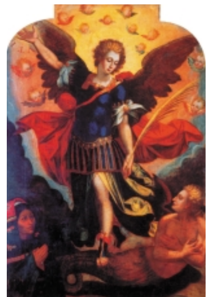
Anonymous, The Archangel Michael vanquishing Satan , Iglesia de San Pedro, Lima.