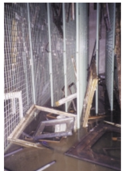
The painting reserves of the Gemäldegalerie Alte Meister in Dresden after the flood in August 2002.