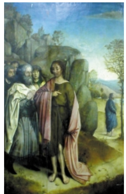
Juan de Flandes, The preaching of John the Baptist (lower left panel of the Miraflores Altar ), National Museum, Belgrade.