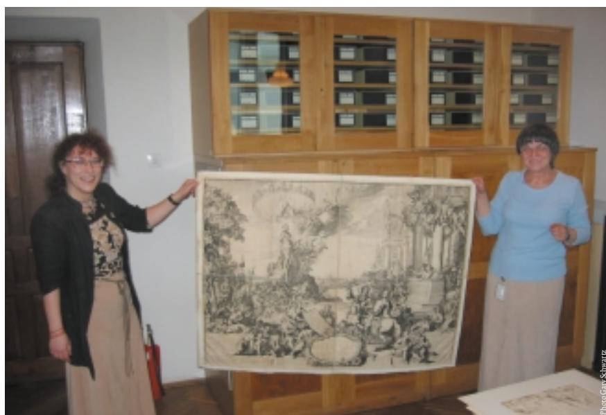
Curators of the Czartoryski Museum, Krakow, holding up Romein de Hooghe's Apotheosis of King John III.