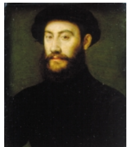
Corneille de Lyon, Portrait of a man , Museo Civico Ala Ponzone.