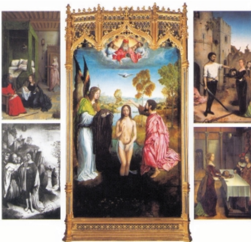
Reconstruction of the Miraflores Altar, a polyptych by Juan de Flandes, ca. 1500, as published in the catalogue of the exhibition Jan van Eyck, Early Netherlandish paintings and the south of Europe, 1430-1530 , in the Groeningemuseum, Bruges 2002.