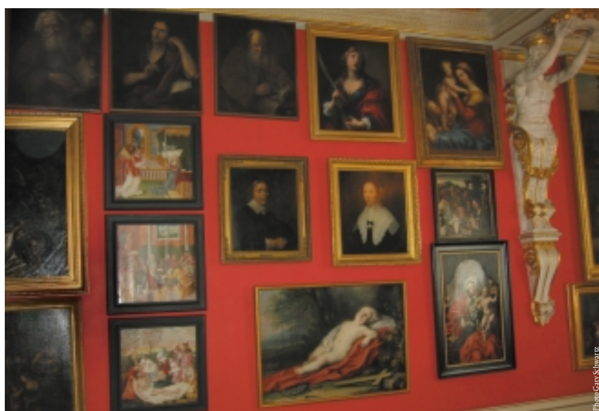
The Dutch Cabinet, Wilanów Palace Museum, Wilanów.

12:00-14:00 Visit to the Royal Castle, in two groups, with a coffee break.