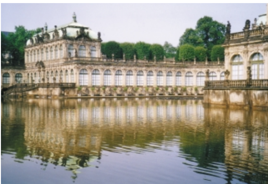
The Gemäldegalerie Alte Meister in Dresden during the floods in August 2002.