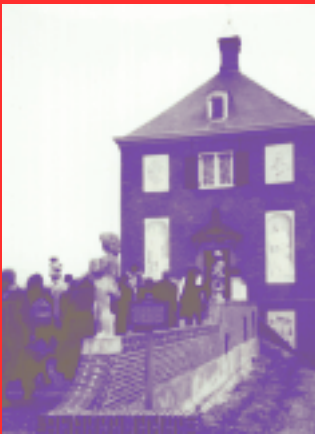
Foreign participants in CODART EEN leaving Huis ten Bosch