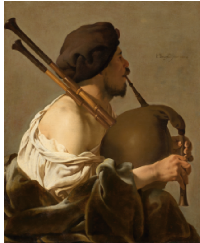
Hendrick ter Brugghen (1588-1629) Bagpipe Player, 1624 National Gallery of Art, Washington, D.C.

Exhibitions have been an important focus for me, starting in 1980 with Gods, Saints and Heroes . Since then, the Gallery has mounted over 40 exhibitions of Dutch and Flemish paintings, including Anthony van Dyck (1990); Johannes Vermeer (1995); Jan Steen (1996); Aelbert Cuyp (2001); Gerard ter Borch (2004); Rembrandt's Late Religious Portraits (2005); Jan Lievens (2008); Dutch Cityscapes (2009); and Joachim Wtewael (2015). Many of these resulted from close collaborations with other museums in the United States and Europe.