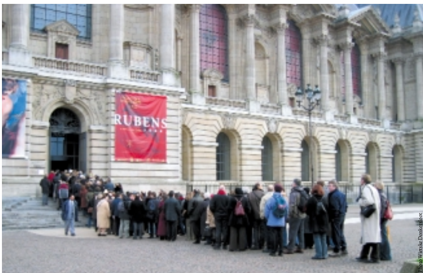
Public waiting in line for the opening of the Rubens exhibition in the Palais des Beaux-Arts, Lille, 6 March 2004.

With so much going for it, it was no surprise that CODART ZEVEN was highly appreciated by the attendees of the congress and participants in the study trip. There was more than enough to make up for the loss of one of the elements in the program. Condition number 4 in the list above was covered, for CODART ZEVEN, by an exhibition of Dutch and Flemish drawings in Poland in the National Museum in Warsaw, curated by Maciej Monkiewicz. This event had to be postponed by the museum, for reasons as yet unclear to us, just six weeks before it was due to open. However, our Polish committee and their colleagues in other museums were able to improvise a solution that provided adequate compensation. At five of the collections we visited, the drawings that had been chosen for the exhibition were brought out and shown in a more informal setting. This format enhanced the 'study' element in the study trip and added to part of our experience while depriving us of seeing the sheets from other collections than these five that had been chosen for the show. Moreover, in Kraków we found more