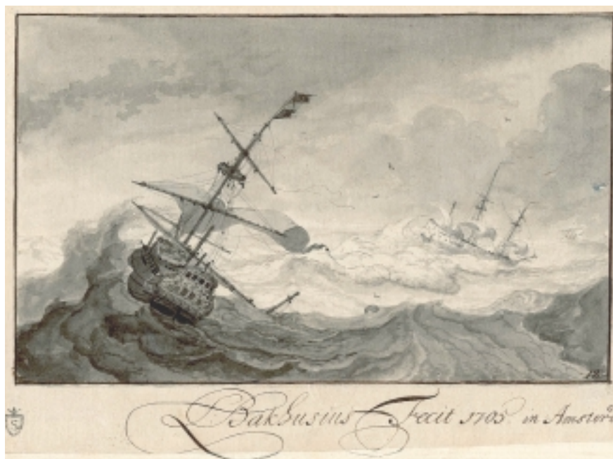
Ludolf Bakhuizen, Stormy sea, 1705, National Museum, Gdańsk.