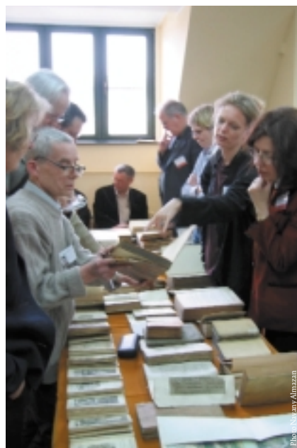
Visit to the Gdańsk Library of the Polish Academy of Sciences.

Warsaw Our tour around Warsaw's Dutch and Flemish collections began the next morning in the Wilanów Palace Museum. Wilanów, or Villa Nova (as the estate was originally called when it was erected as a royal residence in the last quarter of the 17th century), was transformed between the 17th and the 19th century from traditional Polish country house into an Italian Baroque villa and later on a palace in Louis XIV style. A link with the Netherlands is formed by the eight stone statues of the Muses, imported from Amsterdam, that have topped the house since the 1680s. Dutch culture is more strongly