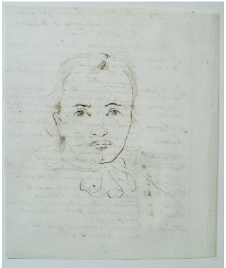
Tilman van Gameren, Self-portrait , print room of Warsaw University Library.

The print room today and the size of its holdings have to a large extent been shaped by events connected with turning points in Polish history during the last two centuries. During the Nazi occupation in the Second World War, the print room suffered severe losses. About 60% of its original holdings were confiscated or destroyed by the occupying German authorities. Despite these losses, the print room of Warsaw University Library is still renowned for its collection of works by European artists and remains one of the richest collections of prints and drawings in Poland. Besides European prints and drawings, the collection comprises a group of works executed in Poland, including architectural and decoration designs. This is one of the most valuable segments of the print room. It