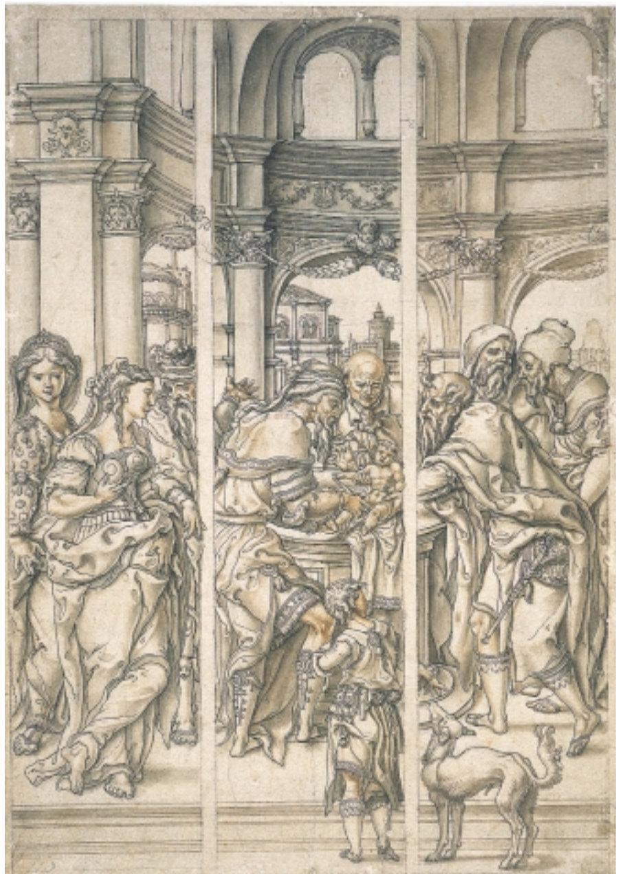
Pieter Coecke van Aelst, The circumcision , design for a stained-glass window, print room of Warsaw University Library.

(Polish Lvov, now in the Ukraine, where it is called Lviv or L'viv) by the co-founder of the institute, Prince Henryk Lubomirski (1777-1850), and on the bequest of the Galician Count Ignacy Skarbek (ca. 1780-1812). As a result of military operations and territorial changes after the Second World War, the Museum of the Princes Lubomirski, which had suffered great losses, was moved first to Kraków and then to Wrocław (formerly Breslau). The high point of the collection of Dutch and Flemish drawings, which contains around 150 items, is a group of works by Rembrandt (three of which have been selected for the exhibition), his pupils and followers (important works in the exhibition include sheets by Bol, Drost, Hoogstraten and one attributed to Carel Fabritius, all formerly