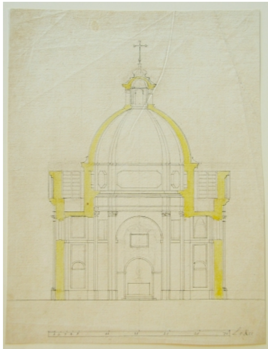
Tilman van Gameren, Church of the Sisters of the Holy Sacrament in Warsaw, section (final stage of design), print room of Warsaw University Library.

Tilman van Gameren's creative talent and extensive knowledge made him the most popular architect in Poland in the last quarter of the 17th century. He designed many secular