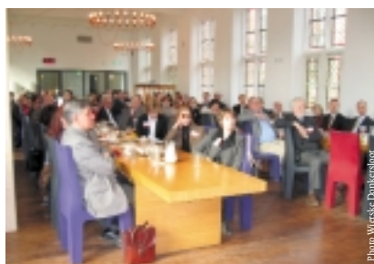
Lunch in the Refectory, Centraal Museum, Utrecht.