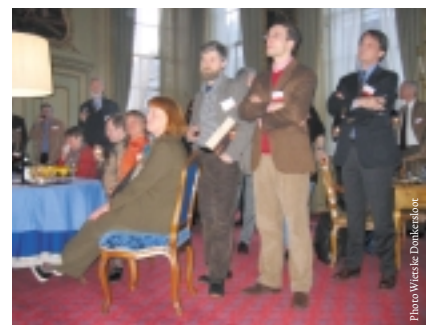
Opening reception of CODART ZEVEN at the Fundatie van Renswoude.