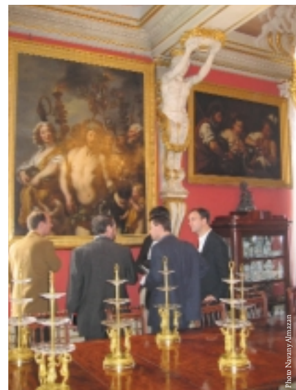
In Wilanów Palace Museum, near Warsaw.