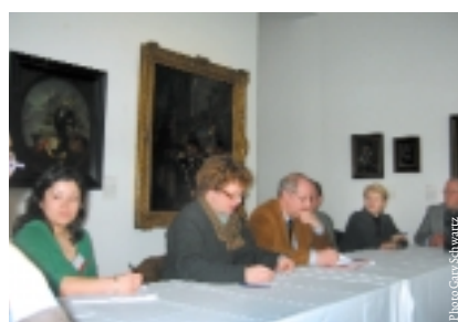
Workshop on collection mobility in the Centraal Museum.

The choice for one or another of these aims is not just a matter of the personal inclinations of the director or the staff. The source of