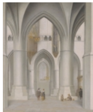
Pieter Saenredam, Interior of the St. Bavo Church in Haarlem (1635), National Museum, Warsaw.

Flemish high Baroque is mainly found in the Warsaw collection and is not as well represented as Dutch 17th-century painting. Although the kings of the Vasa dynasty commissioned numerous paintings directly from the Rubens studio, none of these works has survived in Polish collections. The Vasa monarchs were successful collectors, but the only remaining indications of what they possessed are written sources and a single though very interesting picture showing the Kunstkamer of Crown Prince Ladislaus Sigismund Vasa in the Royal Castle in Warsaw. The prince, the future King Ladislaus IV, made a Grand Tour of Europe in 1624-25, visiting Vienna, the Germanic lands, the Netherlands, France and Italy. This educational and political journey