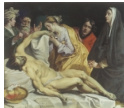
Abraham Janssens, Lamentation , National Museum, Warsaw.

In 1956, Poland's most precious work of art, which had been housed in Gdańsk for almost