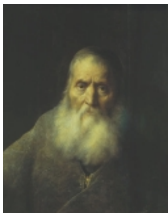
Jan Lievens, Old man , National Museum, Warsaw.

The beginnings and development of independent Flemish landscape painting are well documented in Polish collections, especially in the National Museum in Warsaw, which owns paintings attributed to Gillis van Coninxloo, Jacob Grimmer and Gillis Mostaert, as well as such high-quality examples as Jan Brueghel's Wood landscape with robbers sharing loot ; Abraham Goevaerts's Wood landscape with peasants crossing a ford ; a charming Park landscape by David Vinckboons; numerous Mompers ; and, from the 1640s, Teniers' Landscape with a camp of gypsies , which is very refined in its use of color and is considered quite exceptional in the artist's oeuvre.