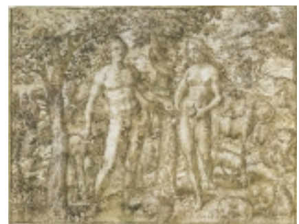
Johan Wierix, Adam and Eve , Princes Czartoryski Foundation at the National Museum, Kraków.

The 16th-century section of the exhibition will open with a group of Renaissance figure drawings (Pieter Coecke van Aelst, Lambert Lombard, Jan van Scorel); this will be followed by a large and varied group of early Mannerist sheets (Maarten van Heemskerck, Lambert van Noort, Crispijn van den Broeck, Marten de Vos, and the workshop of Frans and Cornelis Floris) and the first examples of landscape drawing, some with landscape only, others combined with genre or biblical scenes (Master of the Months of Lucas, Master of the Prodigal Son, Cornelis Massys, Hendrick van Cleve III, Joris Hoefnagel's View of Andernach on the Rhine ). Clearly distinguishable in the group of late