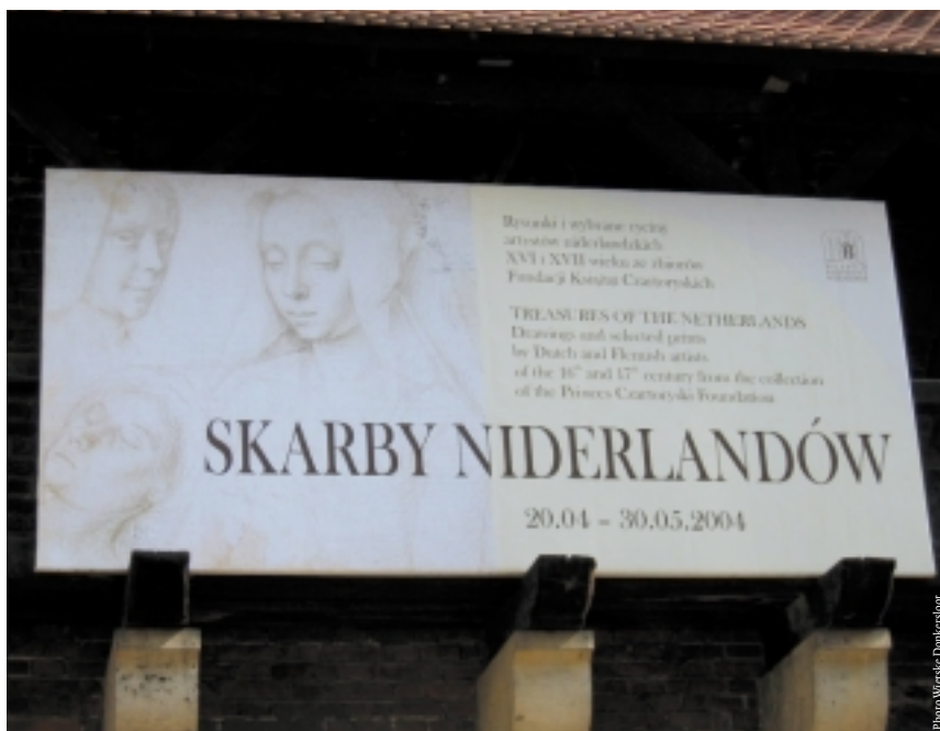
Poster for the exhibition of prints and drawings organized by the Czartoryski Museum in honor of the CODART ZEVEN visit to Kraków: Treasures of the Netherlands.