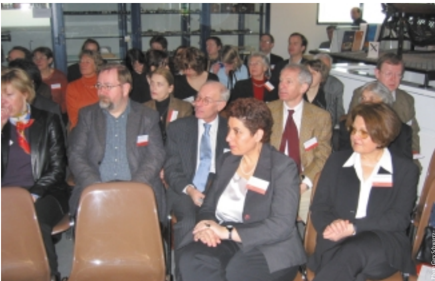
Members' meeting in the Universiteitsmuseum.

In the Netherlands collection mobility is actively promoted by the government through programs of bodies such as the Mondriaan Foundation and the Netherlands Institute for Cultural Heritage (ICN). The Mondriaan Foundation actually demands of museums that received grants that they be involved in a lending network. The ICN manages the state collection with an aim to furthering public access. It operates not only as a lender but also as a broker. In this role it consults with museums over their wishes and tries to help achieve them. The ICN is not even opposed to