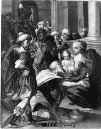
Flemish Master, second half of the 16th century Adoration of the Magi oil on oak, 126.5 x 97 cm Inscribed centre right: M.De Vos (later addition) Inv. No. 373