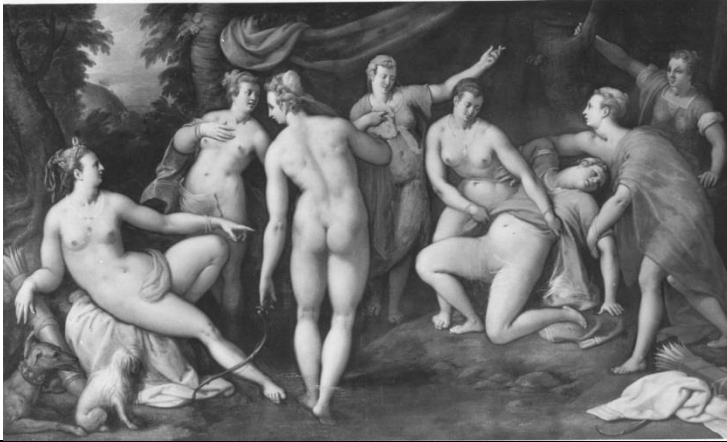
Anthonie Blocklandt ?, 16th century Diana Discovering the Pregnancy of Callisto oil on canvas, 103 x 174 cm Inv.No. 59.2