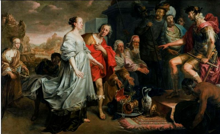
Dutch Painter?, ca. 1670–1675 (?) The Continenence of Scipio oil on canvas, 198 x 325 cm Inv.No. 96.4