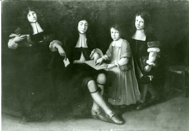
Flemish or French Painter, second half of the 17th century Brothers and Sisters oil on canvas, 130 x 190 cm Inv.No. 82.7