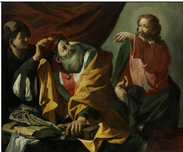
Circle of Hendrick Ter Brugghen, 17th century The Calling of Saint Matthew oil on canvas, 106 x 128 cm Inv. No. 75.15