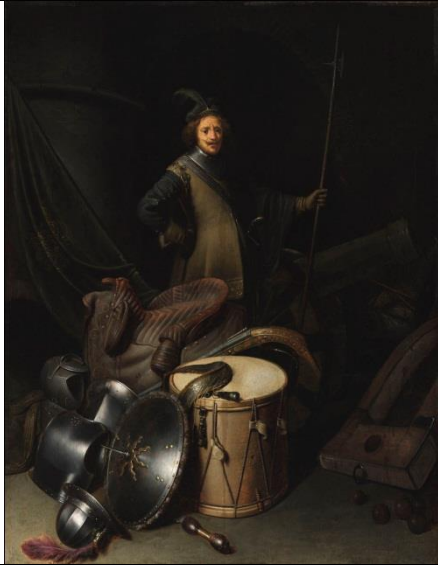
Gerrit Dou Soldier in a Guardroom, ca. 1630– 1635 oil on oak, 66 x 51 cm Inv.No. 62.10