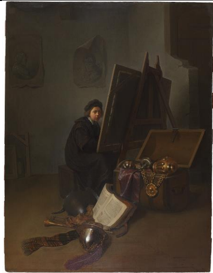
Circle of Rembrandt van Rijn, possibly by Gerrit Dou An Artist in His Studio oil on panel 26¼ by 20 inches (66.5 by 50.8 cm.) Leiden Gallery