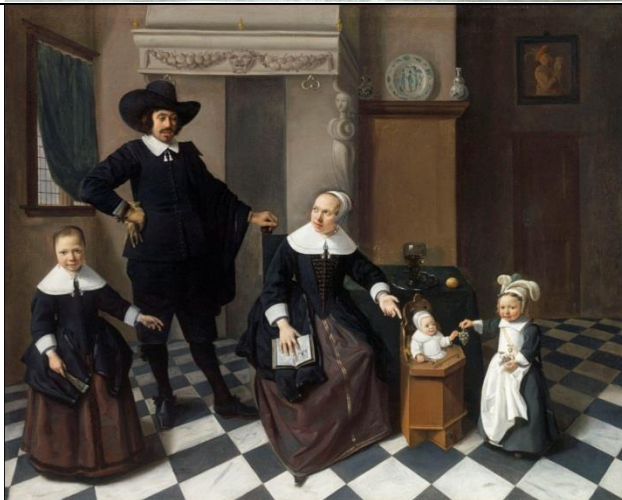
Circle of Pieter de Hooch, ca. 1655– 1658 Portrait of a Family oil on canvas, 85.5 x 107.5 cm Inv.No. 3928