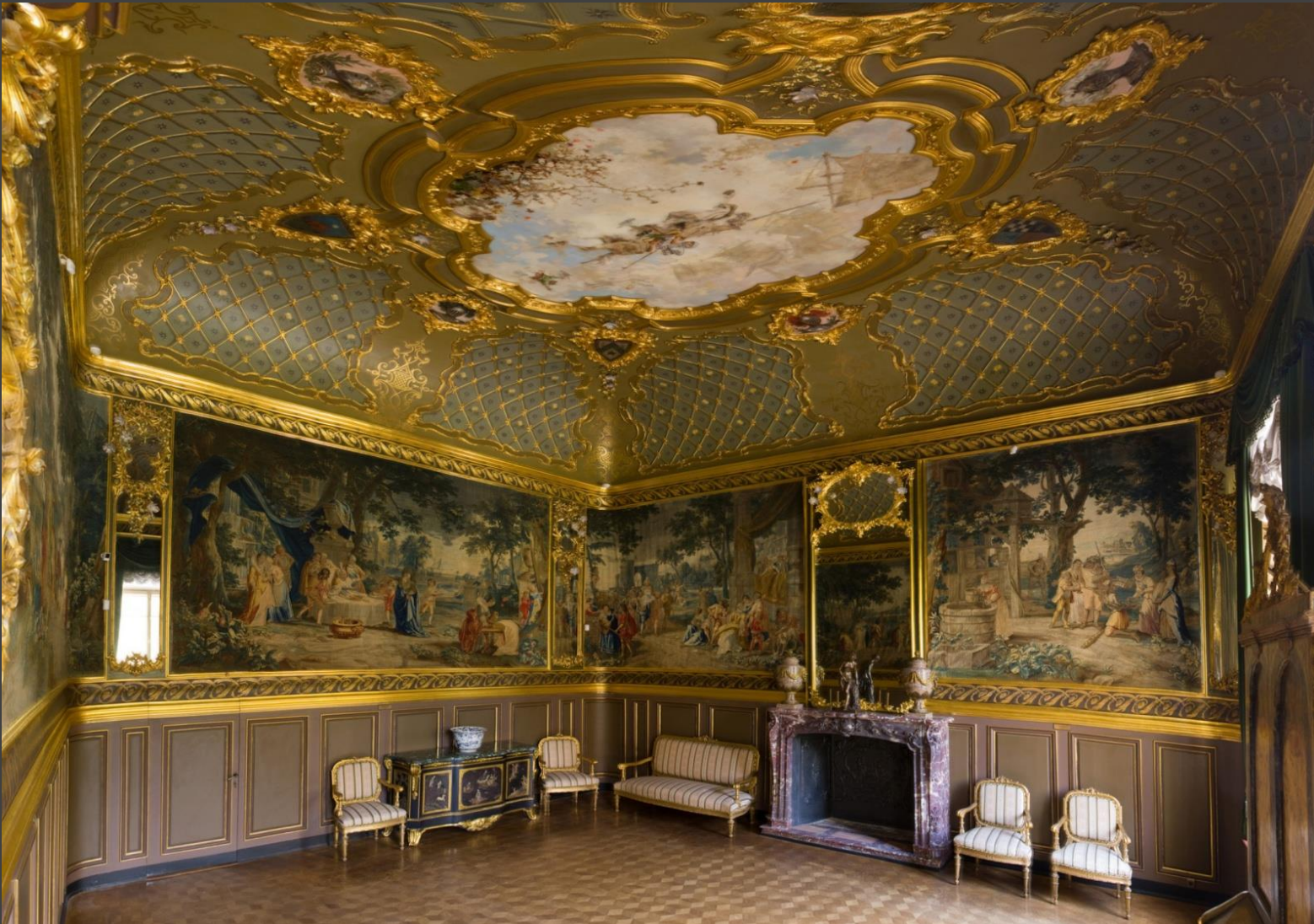
"The Golden Chamber"

European decorative art of the 18th – 19th centuries