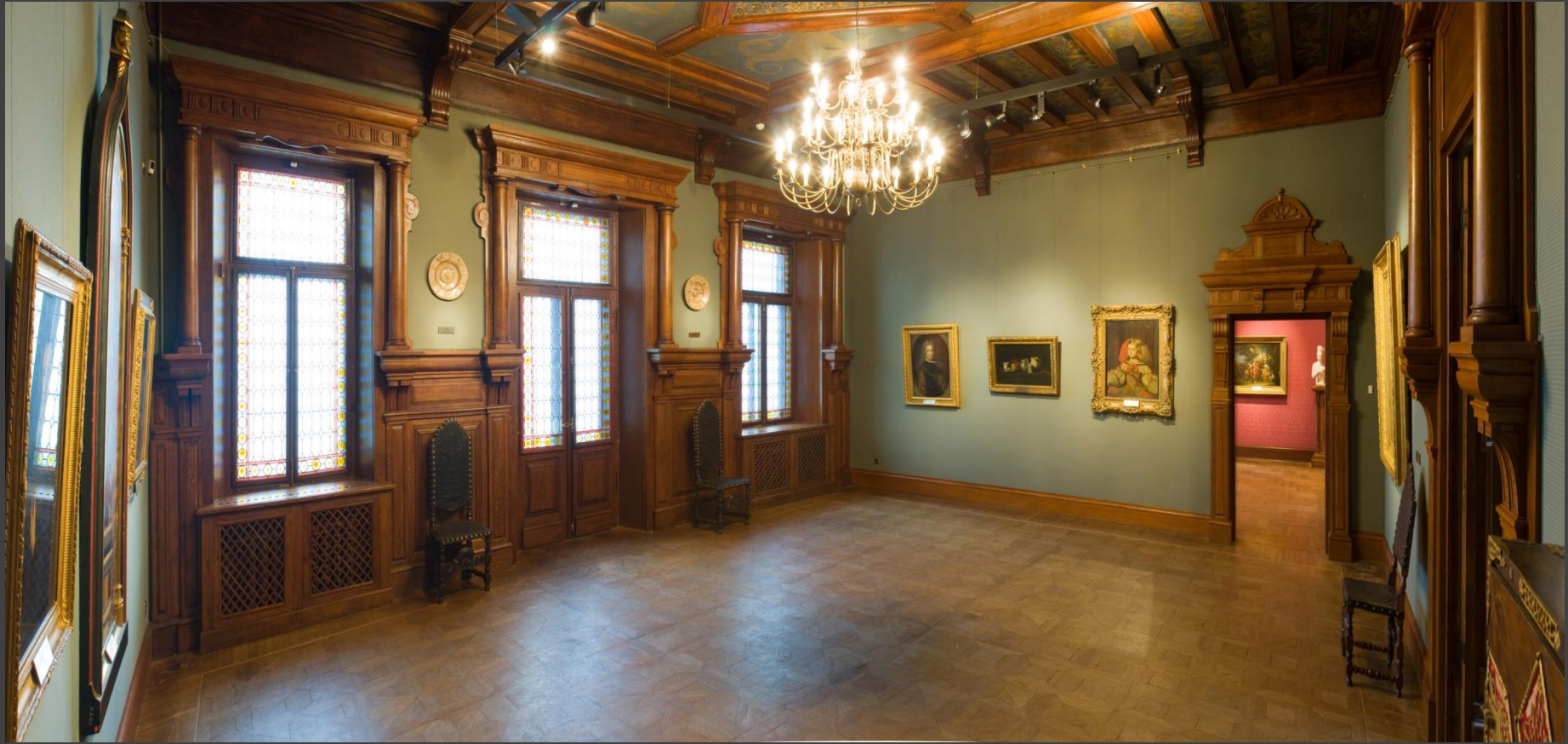
“The Delft Dining Room”