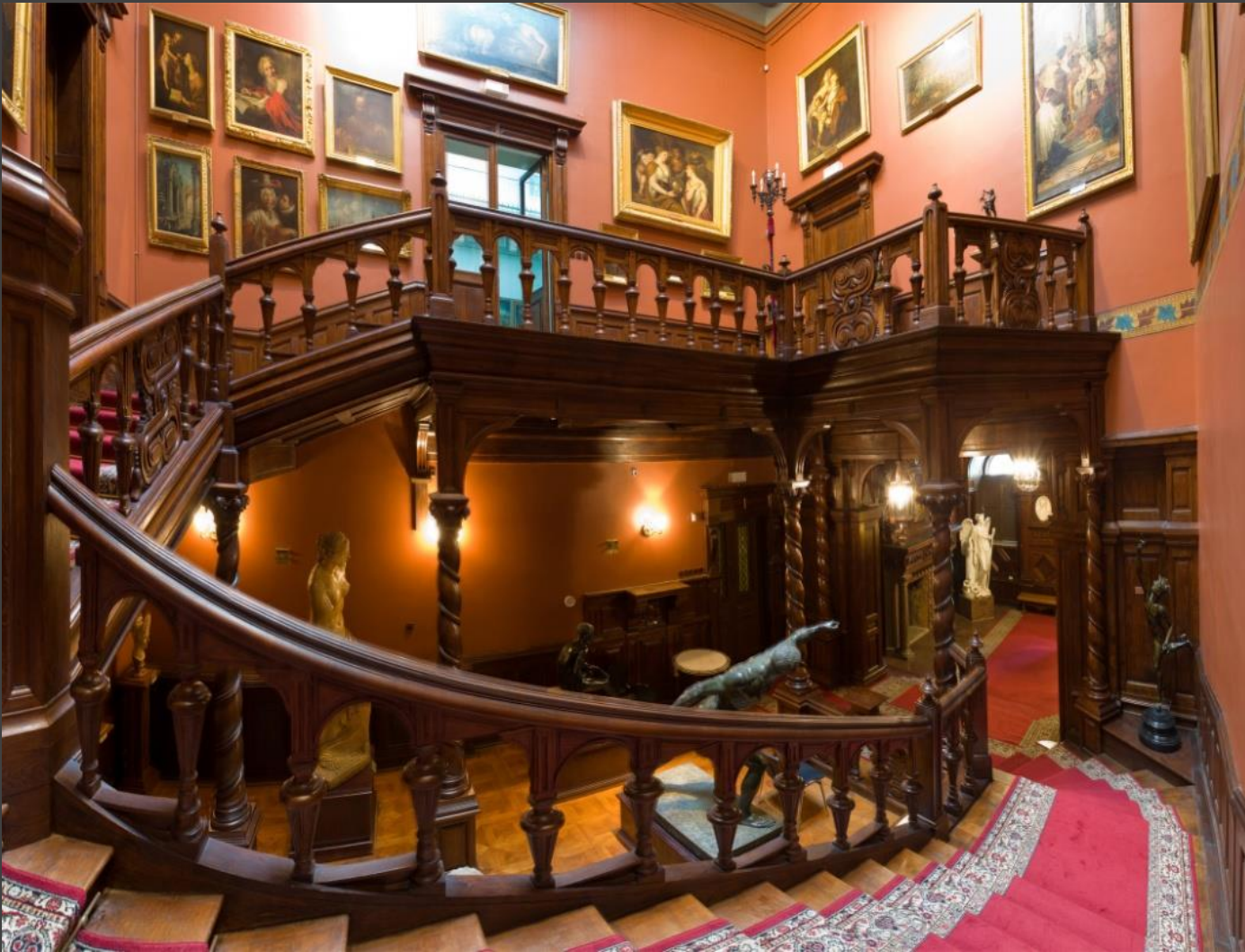
“The Grand Staircase”

Italian Art of the 16th – 18th centuries