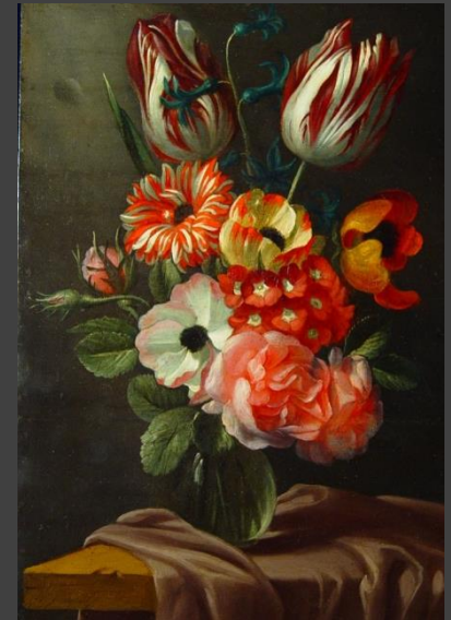
Michel de Bouillon

Modern view of "The Gallery Hall" renewed after the exhibition "European dimension"