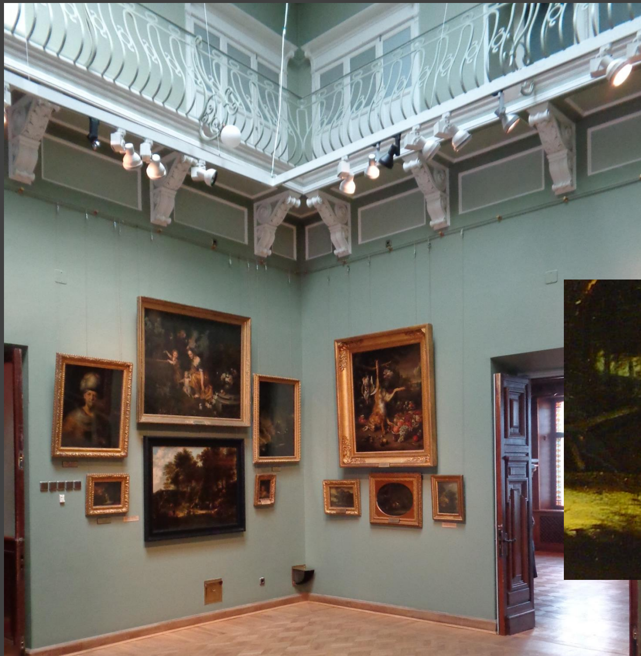
Modern view of "The Gallery Hall" renewed after the exhibition "European dimension"