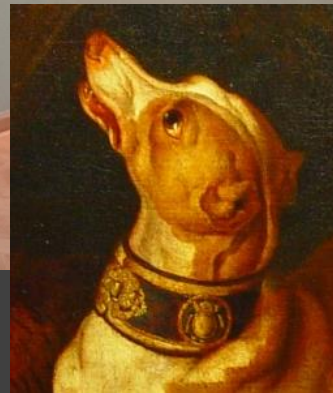
A Hunting Dog and a Cat

Modern view of "The Gallery Hall" renewed after the exhibition "European dimension"