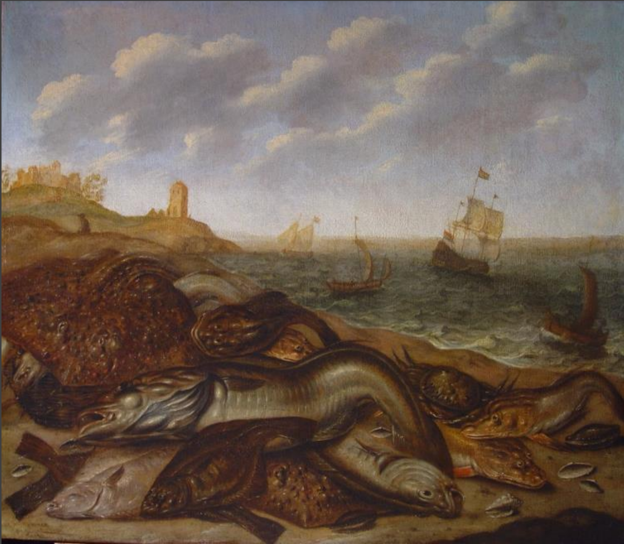
Willem Ormea A Fishes on the Seashore Oil on canvas 75.5 x 87.5 cm

Reattributed and renewed works appeared in the permanent exhibition. Previous variant of display have never been changed since 1998