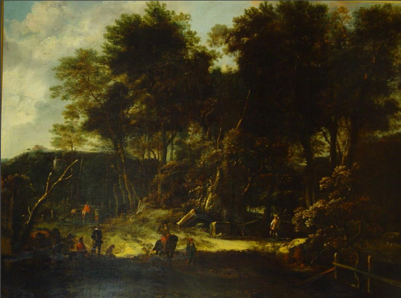
Roelant Roghman Hunters in the woods Oil on canvas 91.5 x 120 cm

During the last four years largely thanks to the CODART congresses, study trips and consultations several important attributions of Dutch and Flemish masters were clarified and the paintings finally left the storage