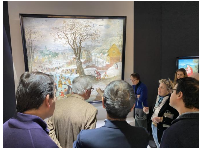
Friends of CODART during the tour of BRAFA Art Fair

This year's Patrons Salon was devoted to challenges and dilemmas in conservation practice, and how curators and conservators work together in order to