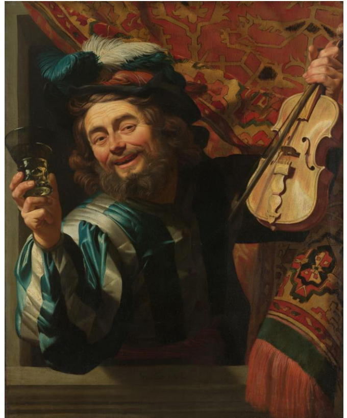
Gerard van Honthorst, The Merry Fiddler , ca. 1623 Rijksmuseum, Amsterdam

A highlight this past year was undoubtedly the CODART Congress in Antwerp, which a number of Patrons also attended. Thanks to the Friends of CODART Grant Program, eleven members from museums with a limited budget were able to participate in this momentous gathering, which, for the first time since the COVID crisis, again saw a large number of participants from more than twenty different countries. On our website you can find a short aftermovie which gives a good impression of the event.